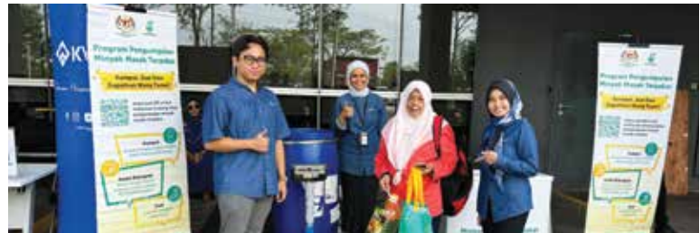
Used Cooking Oil (UCO) collection drive joined by pensioners at KWAP Cyberjaya during KWAP Circular Month 2024