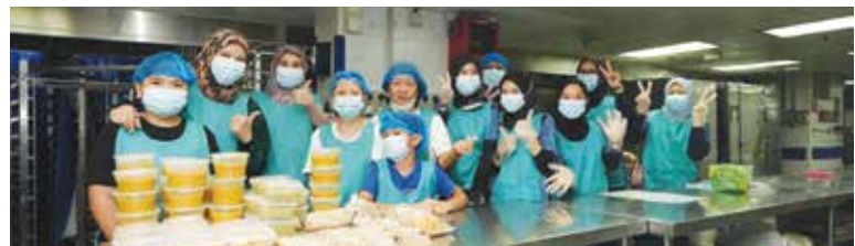
KWAP's Food Warriors comprising KWAP CYCLE volunteers redistributed surplus food during KWAP Inspire Conference 2024, in partnership with What-a-Waste (WaW)