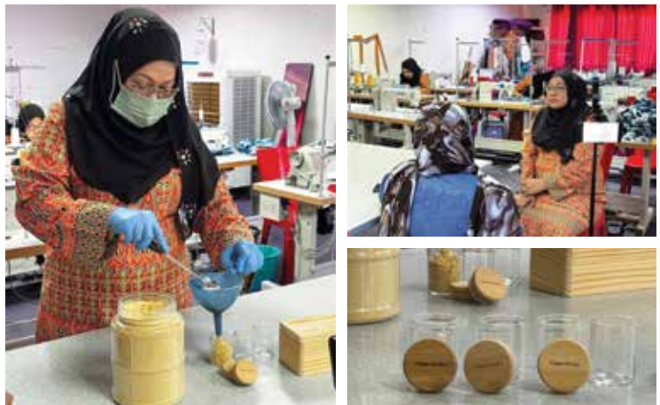
Women of Will produced upcycled merchandise from used hotel linens and recycled glass jars filled with locally sourced spices for the KWAP Inspire Conference 2024, empowering single mothers from PPR Lembah Subang

During the reporting year, a total of over RM157.5 million was spent on the procurement of products and services, of which RM115.2 million (73%), was sourced from 499 local suppliers. These local suppliers constituted 89% of our total supplier base.